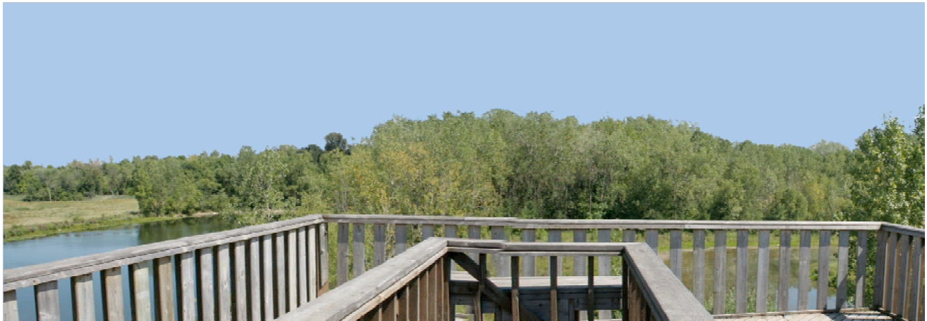
Looking eastward atop the HBMO – ERCA Hawk Tower scanning for raptors.